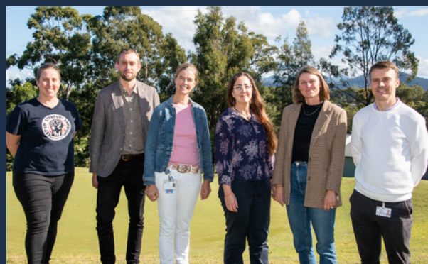
Members of the North Coast Youth Vaping Taskforce at the Coffs Harbour community forum in June