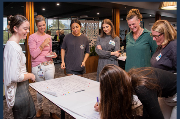
Attendees at the North Coast Youth Vaping Forum in Coffs Harbour

The next steps from these forums will be to collate the discussions, ideas and feedback, and draft the themes, priorities and strategies identified. Further input and consultation will then occur with members from the North Coast Youth Vaping Taskforce, youth and students, community and broader stakeholder groups to prepare the Regional Action Plan.