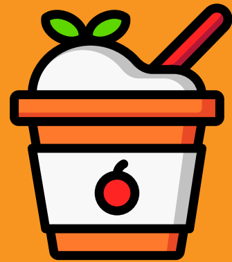
Fruit and yoghurt